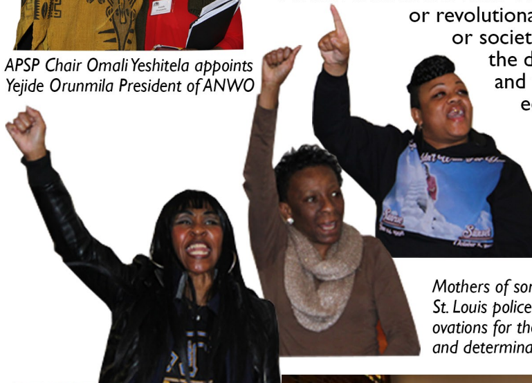
Mothers of sons murdered by the St. Louis police receive standing ovations for their courage and determination