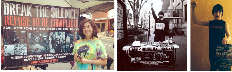
Uhuru Solidarity Movement organizes solidarity in Gainesville, FL for the historic 2015 National Convention, "Break the Silence, Refuse to be Complicit!"

The African People's Solidarity Committee and its mass organization, the Uhuru Solidarity Movement works to bring the worldview of African Internationalism and the demand for reparations into the heart of the white community.