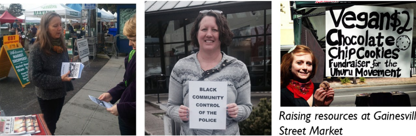
USM winning solidarity in the Pacific Northwest