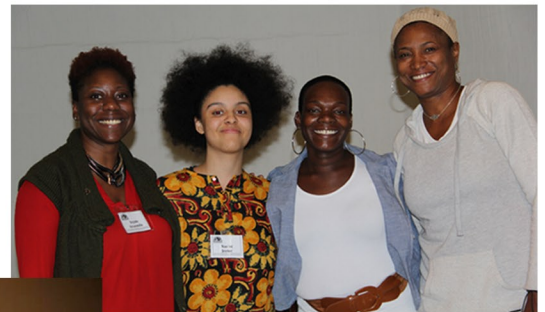
ANWO President with newly elected leadership