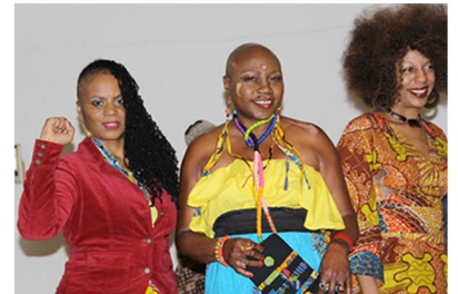
Zenzele Fashions Confident, Revolutionary, Style