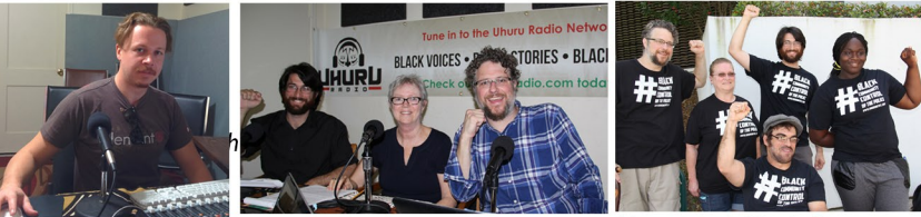
Reparations in Action (RIA) Uhuru Radio show answers the question, "But I'm Irish, do I owe reparations too?...YES!"