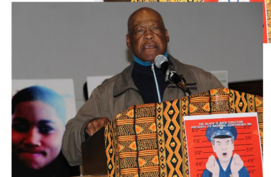
Join one of the Working Groups on Reparations, Political Prisoners, Health