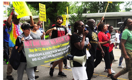
Not Another Black Life!