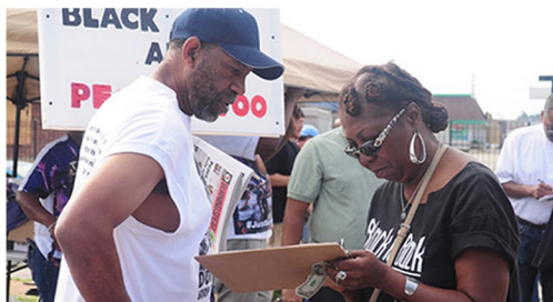
Organizing the people