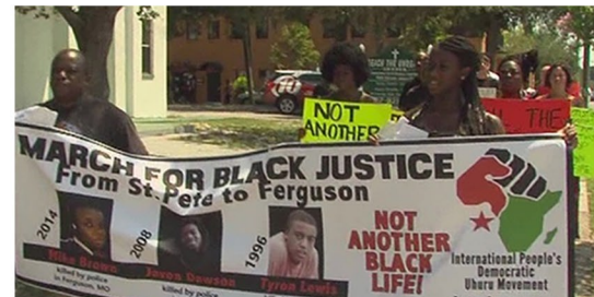
St. Pete Stands with Ferguson