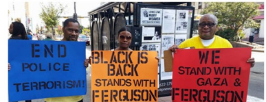
Newark Stands with Ferguson