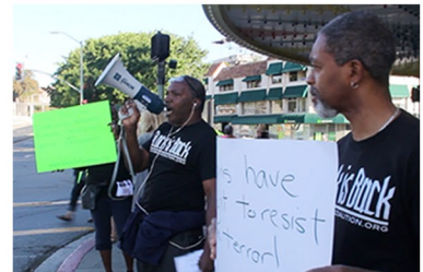
Oakland Stands with Ferguson