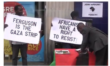
London Stands with Ferguson