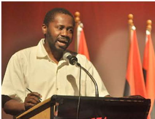
Luwezi Kinshasa, Secretary General of the African Socialist International, gave a powerful presentation on the African Nation at the Sixth Party Congress.

This New Year is a very promising one, with the African Socialist International having a foot in East Africa, West Africa, Europe, North America and the Caribbean.