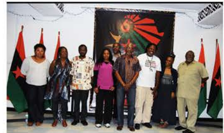
Newly elected National Central Committee of the African People's Socialist Party

The Congress also enjoyed participation from a delegation from Union del Barrio, a Mexican national liberation movement. A video message of solidarity was sent from stateless Romani activists, showing deep unity with African Internationalism and detailing their historic experience of European terror and repression.