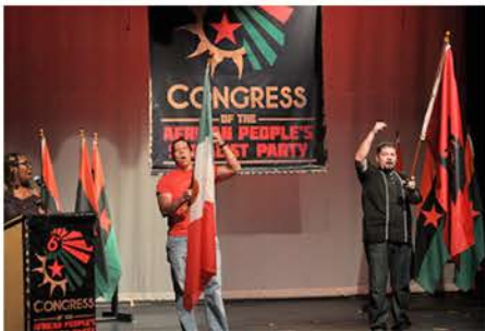
Unión del Barrio Mexican Liberation Organization

Participants in the Congress came from throughout the world. They included delegates from East, West and North Africa; from England and Sweden in Europe; from the Bahamas in the Caribbean; and from Canada and the U.S. in North America.