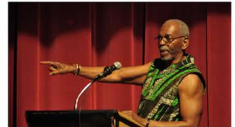
Omali Yeshitela Chairman, African People's Socialist Party and African Socialist International

The capitalist/colonial economic and political system that dominates the world today was born from the attack on Africa and the enslavement of African people in Africa and in the various places we were shipped to against our will. While it provided development and happiness for Europe, it resulted in impoverishment, underdevelopment and misery for most of the world.