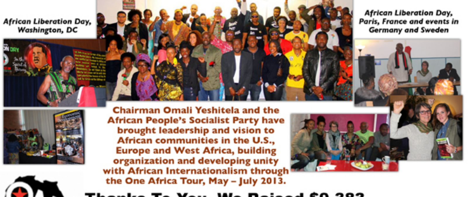
African Liberation Day, Washington, DC