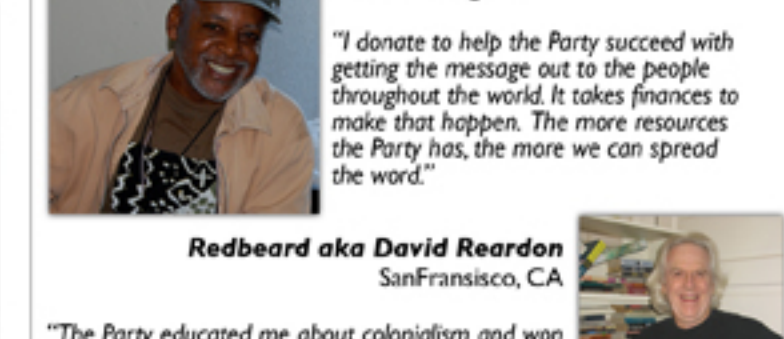
Pop Lancaster St. Petersburg, FL

"I donate to help the Party succeed with getting the message out to the people throughout the world. It takes finances to make that happen. The more resources the Party has, the more we can spread the word."