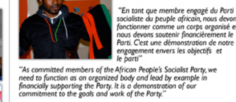
Likay Bombi Congo and United Kingdom

"The Party educated me about colonialism and won me to reparations in 1978. Continuing to support the Uhuru Movement is the logical continuation of my original commitment to provide political and material support for the African Independence Movement, for which I am grateful."