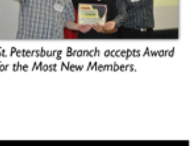
St. Petersburg Branch accepts Award for the Most New Members.